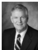
RICHARD B. MYERS, 67.