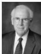
VICTOR H. FAZIO, 66. Senior Advisor, Akin Gump Strauss Hauer & Feld LLP, a law firm.