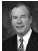
THOMAS B. FARGO, 60. Admiral, United States Navy (Ret.).