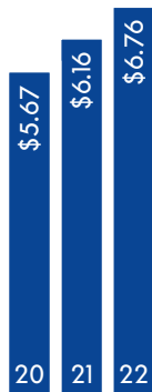
Cash Dividends Declared (per Common share)