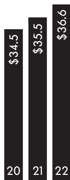
Organic Sales* ($ in billions)