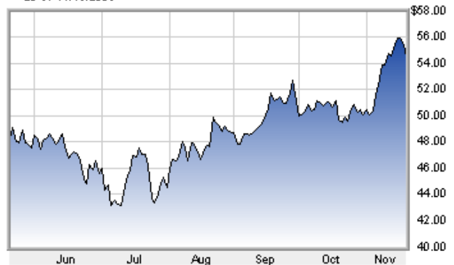
■ NORTHROP GRUMMAN CORP as of 11/19/2009